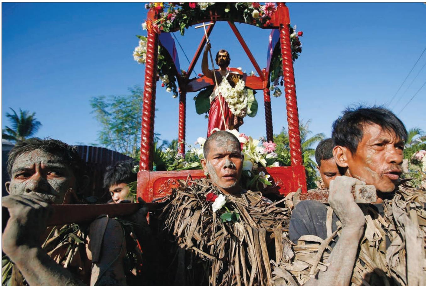
Filipinos carry a statue of St. John the Baptist on June 24 as they take part in a religious ritual known locally as “Taong Putik” (Mud People) in the village of Bibiclat, Philippines, while celebrating the feast of their patron saint. At the Vatican, Pope Francis also celebrated the feast of the birth of St. John the Baptist and called him “the greatest among the prophets.”

(Read all of these stories from our June 26, 1964, issue by logging on to our archives at www.CriterionOnline.com .) †