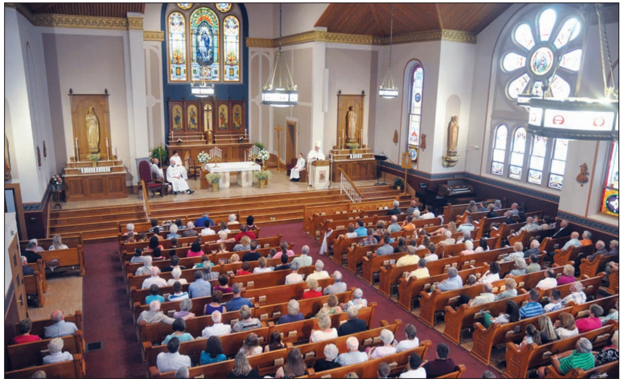
Members of St. Mary of the Immaculate Conception Parish in Rushville listen to Archbishop Joseph W. Tobin deliver a homily during a June 21 Mass in which he blessed the parish's recently renovated church.