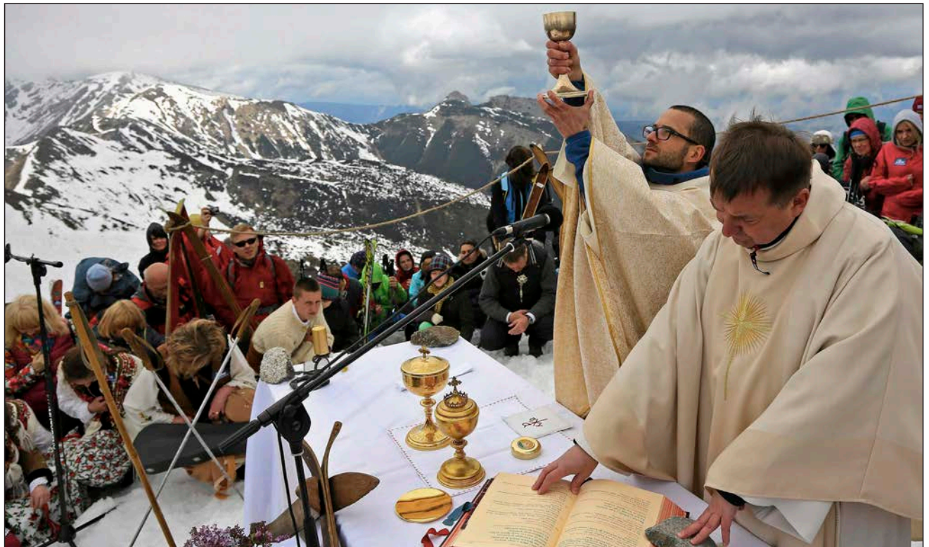
A priest raises a chalice as he celebrates Mass in honor of the canonization of SS. John Paul II and John XXIII in the Kasprowy Wierch ski resort in Poland's Tatra Mountains on April 27. That day at the Vatican, Pope Francis declared as saints the two former popes.

But how is the Eucharist a celebration? I pondered that question recently after hearing several news reports mention Masses that Pope Francis “delivered.” Delivered? Surely the Mass is not “delivered” like a prepared speech or a package