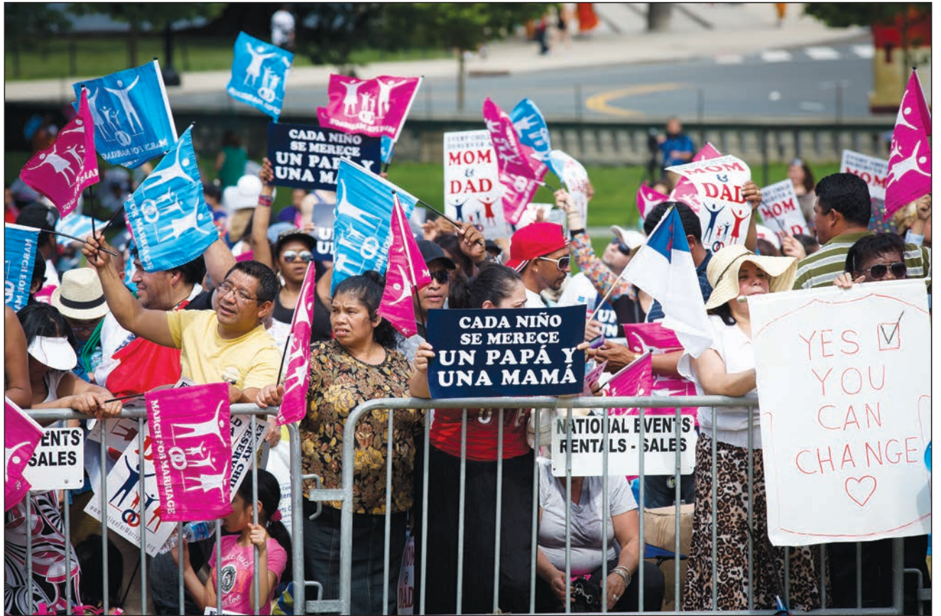
Supporters of traditional marriage wave flags and signs on the West Lawn of the Capitol in Washington on June 19 at the second annual March for Marriage. Thousands of participants walked from the National Mall to the U.S. Supreme Court, where they heard speakers express support for marriage between one man and one woman.

Several marchers likened the event to the March for Life. They expressed hope that the March for Marriage