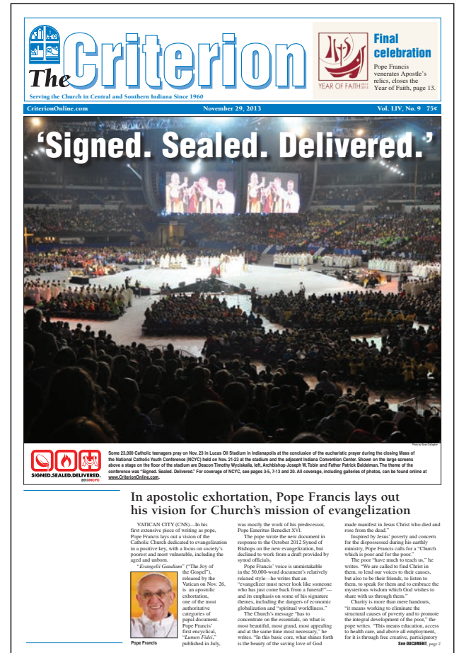
The Criterion's coverage of the National Catholic Youth Conference in Indianapolis last November won third place in best reporting on special age group, children and teenagers, in the Catholic Press Association's (CPA) 2013 awards competition.