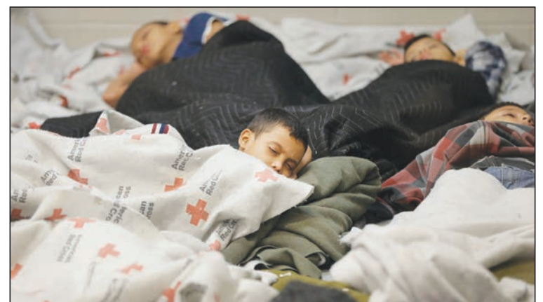
Detainees sleep in a holding cell at a U.S. Customs and Border Protection processing facility in Brownsville, Texas, on June 18. The federal agency provided media tours on June 18 of two locations in Brownsville and Nogales, Ariz., that have been central to processing at least 52,000 unaccompanied minors who have been detained in the U.S. this fiscal year.