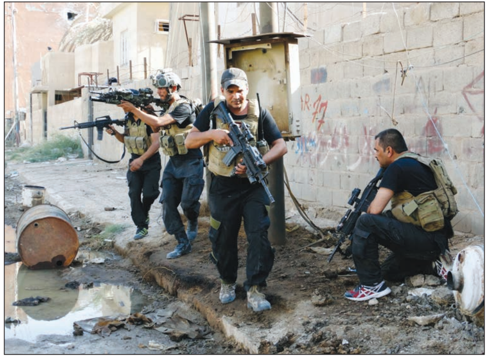
Members of the Iraqi Special Operations Forces take their positions during clashes with the militant Islamic State of Iraq and the Levant in the city of Ramadi on June 19. Saying the United States has a special responsibility to the people of Iraq, the chairman of the U.S. bishops' Committee on International Justice and Peace called for diplomatic measures rather than a military response to the crisis facing the country.

"A military solution—whether it includes airstrikes or ground troops or an increase in the flow of weapons into Iraq—will only serve to increase the suffering of the Iraqi people, not alleviate it," the statement said. †