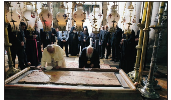
Pope Francis and Ecumenical Patriarch Bartholomew of Constantinople venerate the Stone of Unction in Jerusalem’s Church of the Holy Sepulchre on May 25. The two leaders marked the 50th anniversary of the meeting in Jerusalem between Pope Paul VI and Patriarch Athenagoras.

Attending the lecture was Archbishop Joseph W. Tobin. He had a special interest in the topic because he serves as