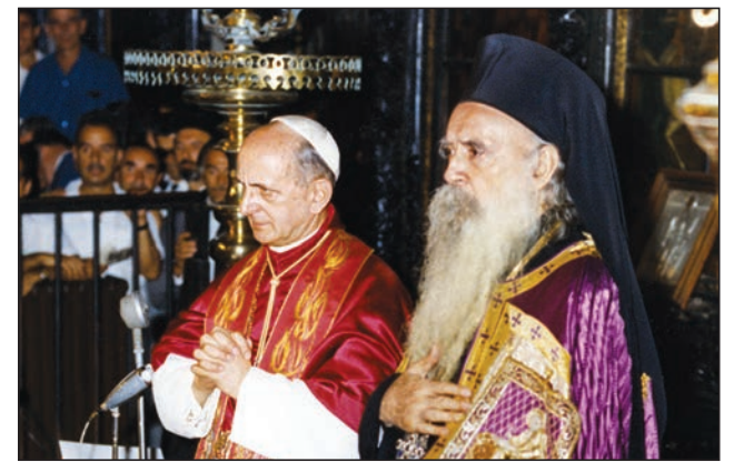
Pope Paul VI and Ecumenical Patriarch Athenagoras attend a prayer service in Jerusalem in January 1964. Pope Francis met Ecumenical Patriarch Bartholomew on May 25 during his three-day visit to the Holy Land.

co-chairman of the North American Orthodox-Catholic Theological Consultation.