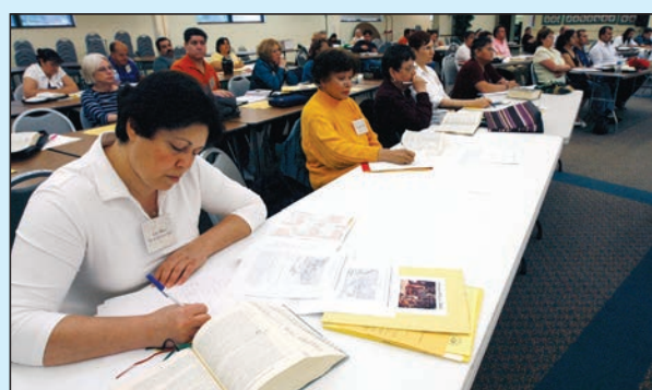
A class meets for Spanish Bible study at St. Giles Church in Oak Park, Ill. When parents make the effort to continually form their faith, their children can also benefit and gain a stronger connection to the Church.

“Since parents have given children their life, they are