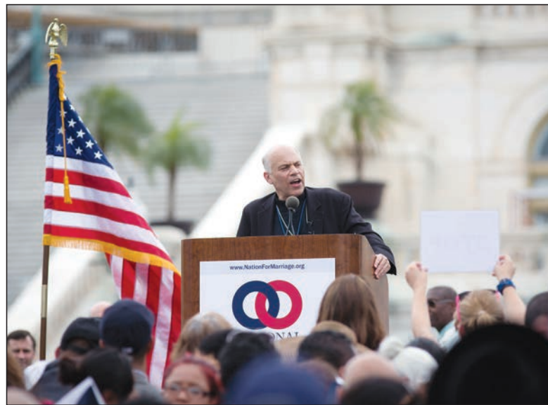
Archbishop Salvatore J. Cordileone of San Francisco, chairman of the U.S. Conference of Catholic Bishops' Subcommittee for the Promotion and Defense of Marriage, addresses several hundred supporters of traditional marriage during the second annual March for Marriage on the West Lawn of the Capitol in Washington on June 19. Archbishop Cordileone praised the 6th Circuit panel's majority ruling on Nov. 6 upholding citizens' rights "to protect and defend marriage as the unique relationship of a man and a woman."

Catholic teaching upholds the traditional definition of marriage and holds that any sexual activity outside of marriage is sinful. The Church also teaches that