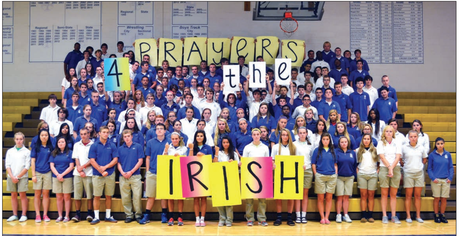
The senior class of Bishop Chatard High School in Indianapolis sent this photograph to the students of neighboring Cathedral High School in August to show their support after the suicide of a Cathedral senior. Less than three weeks later, another Cathedral teen committed suicide.