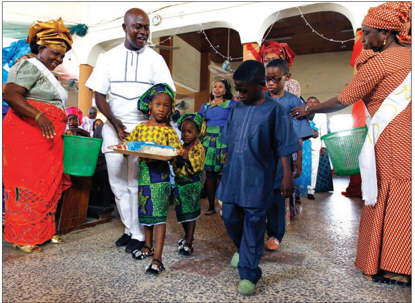
A family walks with gifts toward the altar during a New Year's Mass of thanksgiving at Holy Rosary Church in Abuja, Nigeria, on Jan. 1. Parents face many challenges in today's secular culture to form their children so that they will be faith-filled adults.

If we've shown them an example of forming our own values and decisions from the foundation of our faith,