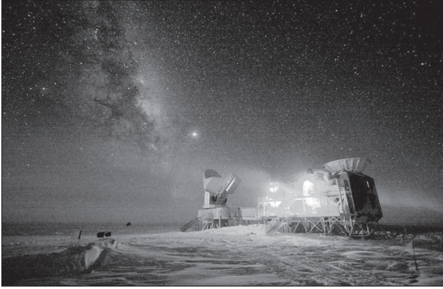
The South Pole Telescope and the Background Imaging of Cosmic Extragalactic Polarization experiment, or BICEP2, at Amundsen-Scott South Pole Station are seen against the night sky in this National Science Foundation picture from 2008. Researchers used the equipment to detect ripples in the space-time fabric that echo the massive expansion of the universe that took place just after the Big Bang. Pope Francis on Oct. 28 told the Pontifical Academy of Sciences that the Big Bang theory and evolution do not eliminate the existence of God, who remains the one who set all of creation into motion.