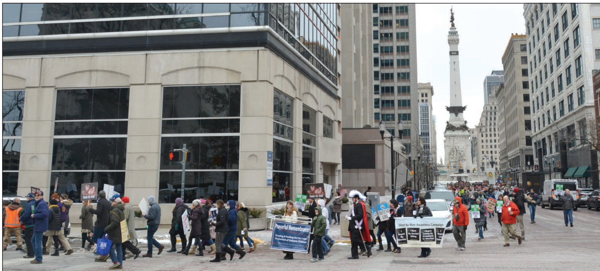
Having processed by the Indianapolis' Soldiers and Sailors Monument, participants in the Indiana March for Life on Jan. 22 round a corner to start processing around the Indiana Statehouse.