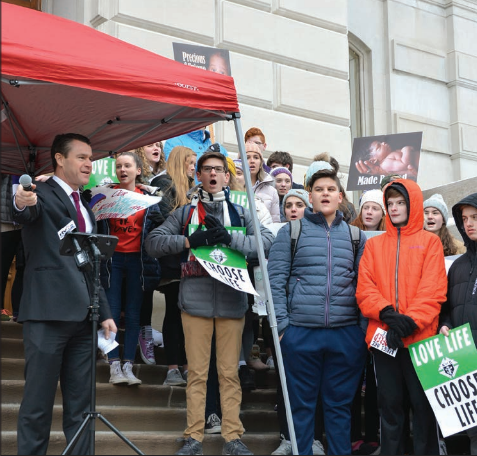
At a rally on the Statehouse steps following the Indiana March for Life in Indianapolis on Jan. 22, U.S. Sen. Todd Young of Indiana holds a microphone to a crowd of about 700 to catch their shouts after asking, "Do we love babies, Hoosiers?"