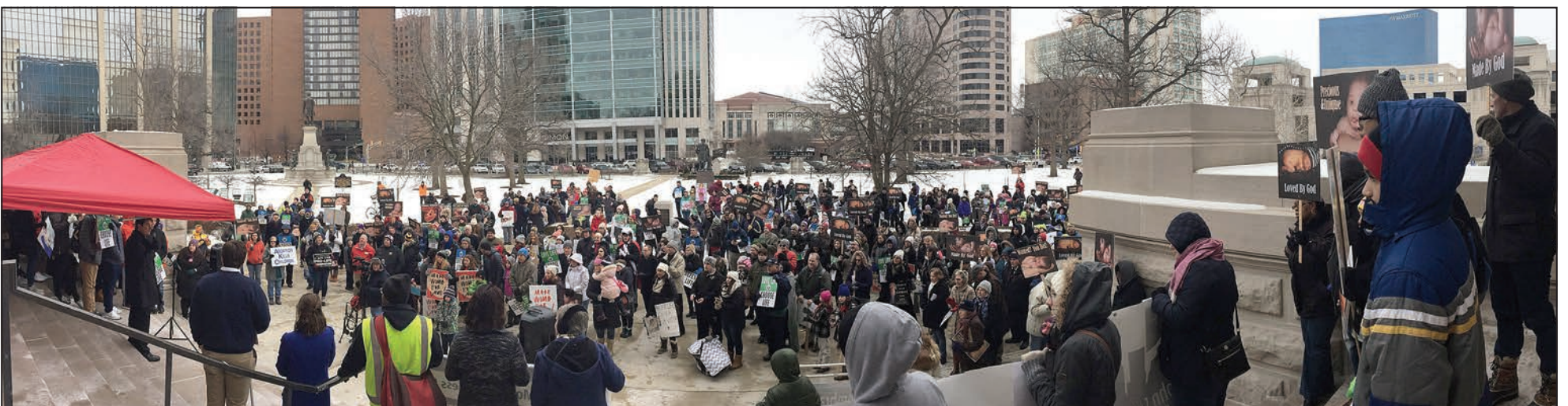
A panoramic shot from the south steps of the Indiana Statehouse captures a portion of the roughly 700 people attending a rally after completing the Indiana March for Life in Indianapolis on Jan. 22.