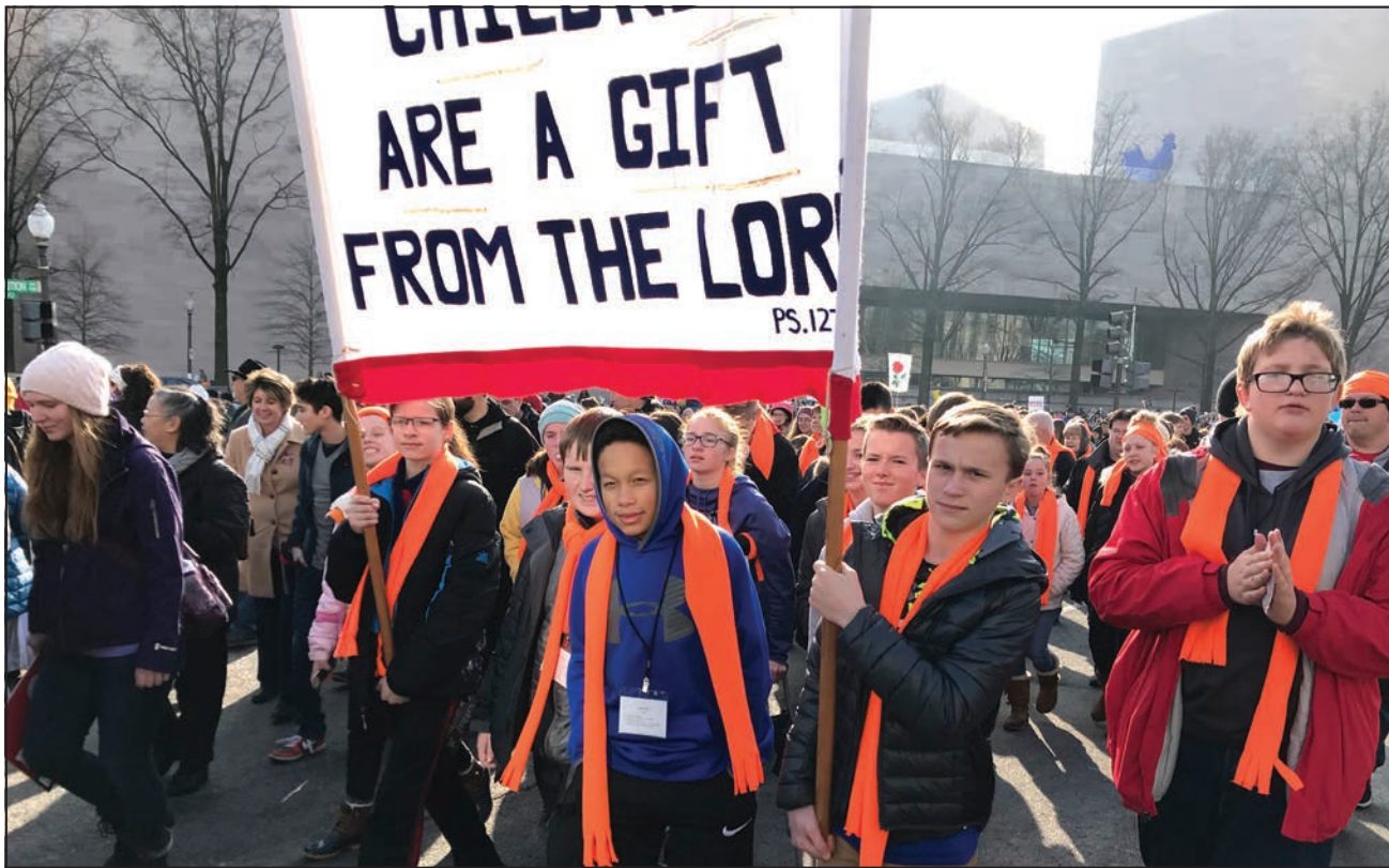
Seventh- and eighth-grade students from St. Nicholas School in Ripley County in southern Indiana walk with a banner that declares, "Behold: Children are a gift from the Lord," during the March for Life in Washington on Jan. 18.

But what stood out to him even more was seeing "all these banners from different schools and different organizations across the country. There were hundreds of thousands of people there."