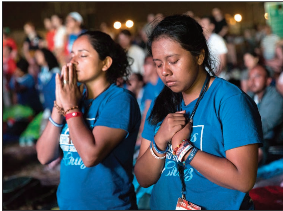
Pilgrims pray during Pope Francis' World Youth Day vigil at St. John Paul II Field in Panama City on Jan. 26. (CNS photo/Jaclyn Lippelmann, Catholic Standard)

(CNS photo/Jaclyn Lippelmann, Catholic Standard)