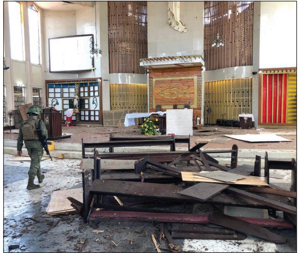
A Philippine army member inspects damage inside the Cathedral of Our Lady of Mount Carmel following a bomb blast in Jolo on Jan. 27. The explosion, during morning Mass killed at least 20 people and wounded dozens of others.

"The Senate's rejection of this common-sense legislation is radically out of step with most Americans," Cardinal Timothy M. Dolan of New York said in a statement as then-chairman of the U.S. bishops' Committee on Pro-Life Activities. †