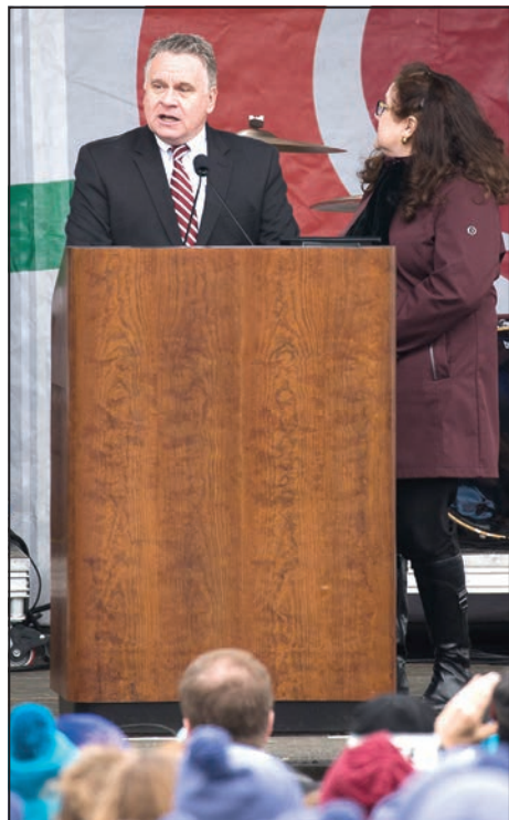
U.S. Rep. Chris Smith, R-N.J., speaks during the annual March for Life rally in Washington Jan. 18.

The poll also showed that 75 percent of respondents want "substantial" restrictions on abortion access even as more than half of respondents describe themselves as