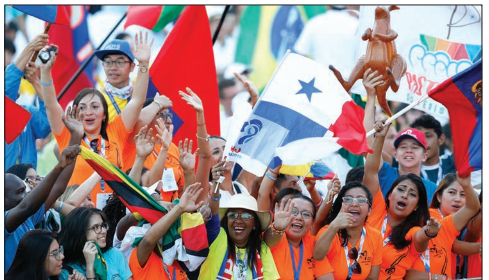
Pilgrims cheer before Pope Francis' celebration of Mass for World Youth Day pilgrims at St. John Paul II Field in Panama City on Jan. 27.