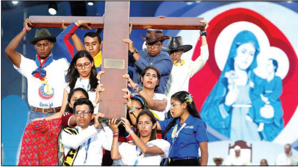
Pilgrims carry the World Youth Day cross as Pope Francis joins them in the Way of the Cross at Santa Maria la Antigua Field in Panama City on Jan. 25.